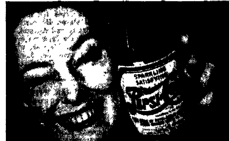
Pepsi-Cole Company, Long Island City, N. Y. Franchised Bettler; Pepsi-Cola Hottling Company 82 Love St. Wisconsin Rapids, Wis. Phone 343